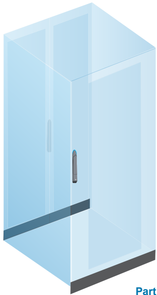
Part no. : PSK-800W-NSR ( 800 wide for front & rear side )