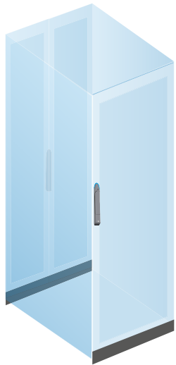
Part no. : PSK-600W-SR ( 600 wide for front & rear side )